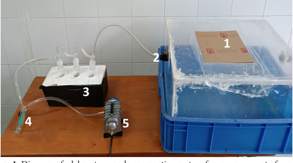
Figure 1. Diagram of a laboratory-scale composting system for measurement of gaseous emissions. (1) Composting tray with acrylic lid, (2) air valve, (3) three consecutive impingers, (4) rotameter, (5) air pump.

A photo of a composting tray and its associated equipment is shown in Figure 1. The laboratory-scale composting experiment was done in a plastic composting tray ( 61 \times 42 \times 15 cm) mounted with an airtight transparent acrylic lid, with a total volume of 53.2 L, for 14 days.